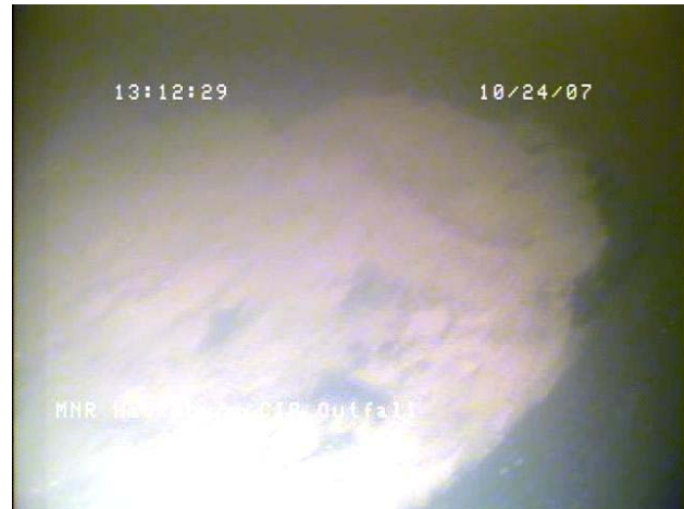
Broken end of pipe on support (photo 2)