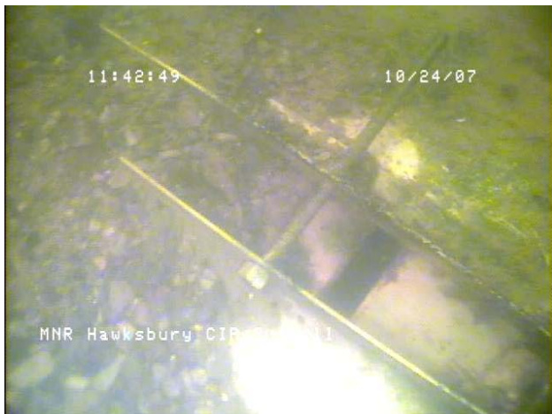
S.S. Clamp at joint in pipe (photo 1)